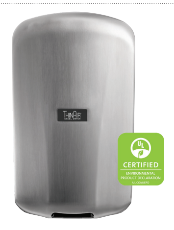
TA-SB Brushed Stainless Steel