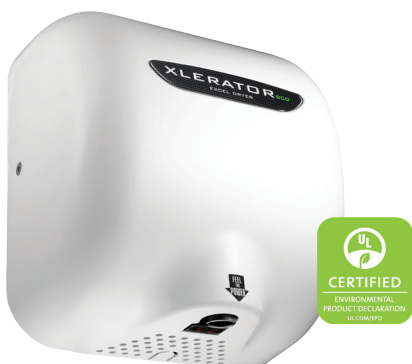
XL-BW-ECO White Thermoset Resin (BMC)