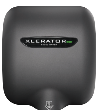
XL-GR-ECO Graphite Textured Painted