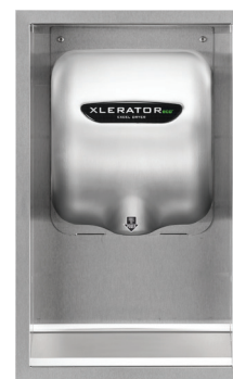
Part # 40502