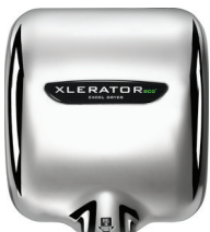
XL-C-ECO Chrome Plated