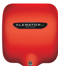
XL-SP-ECO** Custom Special Paint