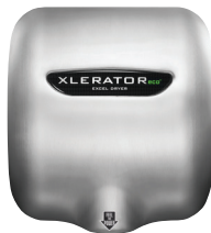
XL-SB-ECO Brushed Stainless Steel