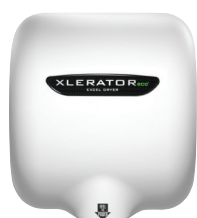
XL-W-ECO White Epoxy Painted