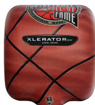
XL-SI-ECO*** Custom Special Image